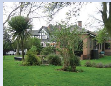
The Gate Hangs Well