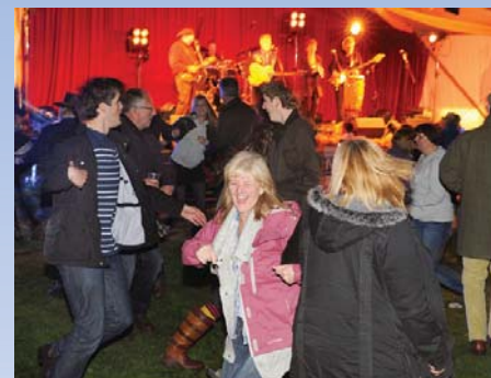
Music in the Meadow