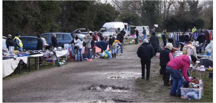
Quorn Car Boot Sale, by Susie Brady - www.susiebrady.co.uk

Car boot sales are good hunting grounds if you have a passion for bargains. They also provide a convenient way of raising cash from items you might otherwise throw out. You need to be up early in the morning to get the most from them though! Here are some that operate locally. For more, visit www.carbootsales.org .